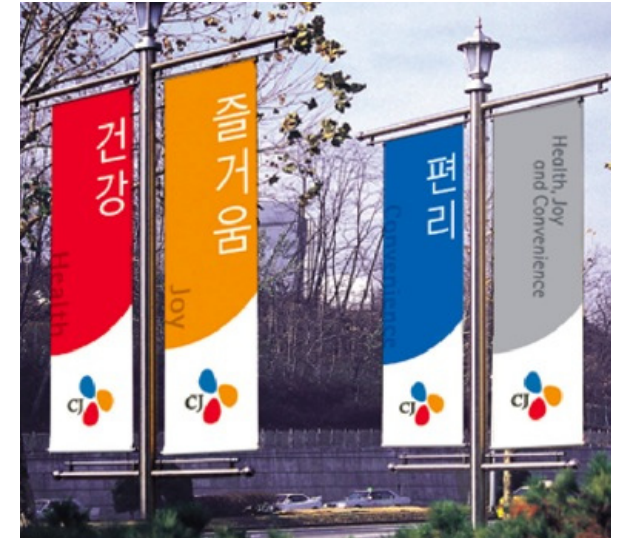
The simplicity of the identity allows for colorful and memorable expressions across a range of media.